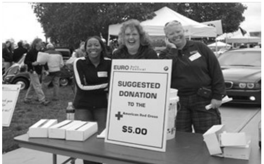
Volunteers from the Piedmont and Upstate Chapters work booths at Eurofest every year.

Last year, Eurofest donated $40,000 to the American Red Cross Disaster Relief Fund.