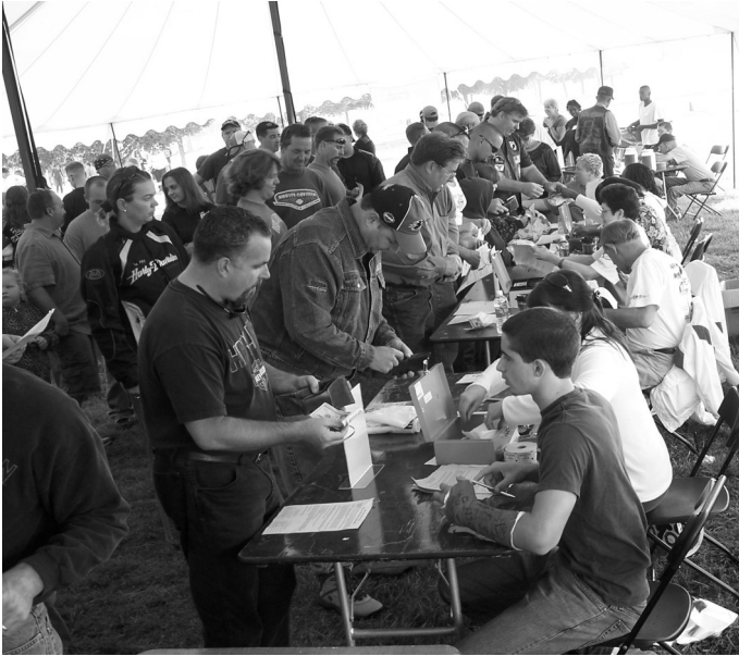
Volunteers register participating motorcyclists at the Rally.

September and October welcomed bikers and car buffs alike as the Piedmont Chapter joined forces with the Upstate Chapter to participate in two special events. The money raised at both events was divided between the Chapters to fund Red Cross programs and services. Volunteers from the Piedmont Chapter were present at the Motorcycle Rally in September and Eurofest in October to help promote the Red Cross.