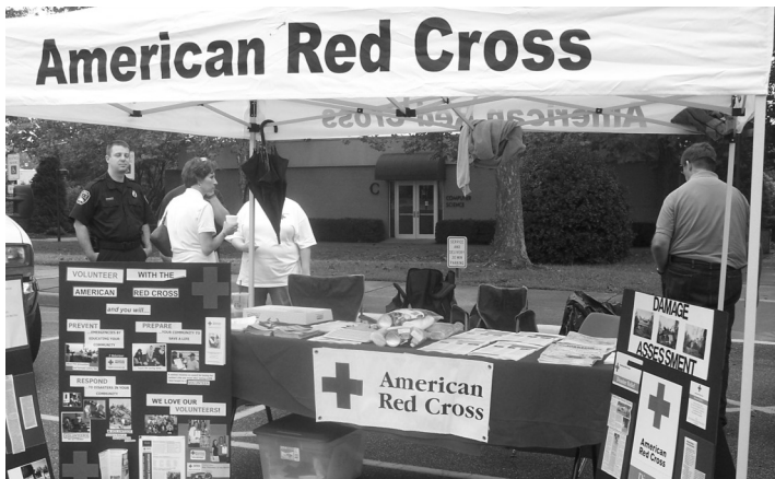
Red Cross booth at Community Emergency Preparedness Day.