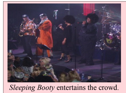
Sleeping Booty entertains the crowd.

Once again, Retro Fest succeeded in showing the community a good time and raising money to support the programs and services of the Piedmont Chapter. Thanks to all the volunteers who made the event possible!