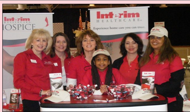
A Taste of Cherokee sponsor Interim HealthCare at their table.

The ninth annual A Taste of Cherokee was held on March 6, 2010 from 11:30 am-3:00 pm at the Broad River Cooperative in Gaffney. This is the largest fundraiser for the Piedmont Chapter in Cherokee County; all money raised at this event will benefit the Red Cross office in Cherokee County.